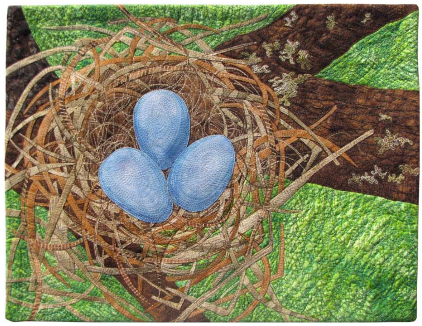
"Nestled" (15-1/4" x 11-3/4") by Susan Brubaker Knapp