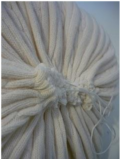
Take a stitch across the top gather and back down through to the bottom pulling tightly to create an indent in the top.

Repeat this 4 or 5 times, taking your top stitch across at different places to help tuck in that top seam. Your pumpkin should look like this when you have finished stitching.