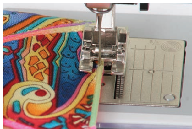
Fold one of the triangles in half to sew the last seam.