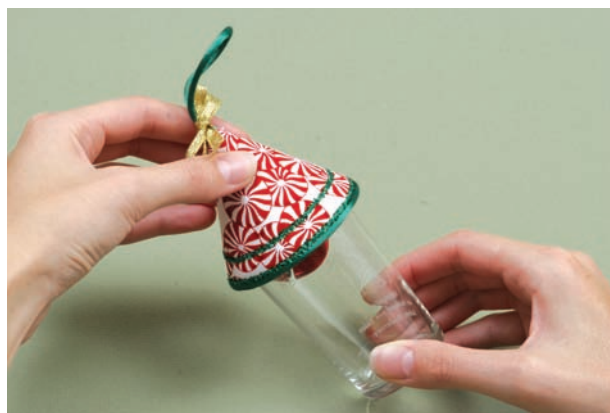
Cool to shape over a small glass after steaming.

9. Steam it a bit (page 11) and gently hold it over the base of a small glass (I finally found a use for that cute shot glass in the back of the cupboard!) to get a nice round shape.