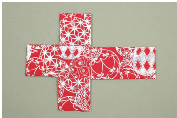
Sew the squares together, ready to shape into a box.