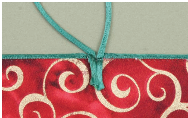
Leave cording at the start and a loop at the end.

6. At the end, make a loop of cording. Use 6"–8" of cording, depending on how low you want it to hang. Bring the end of the cording across the start of the loop and anchor it well. Trim the end to about 1". These ends will be hidden inside the bell.