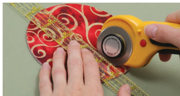
Cut the circle in half.