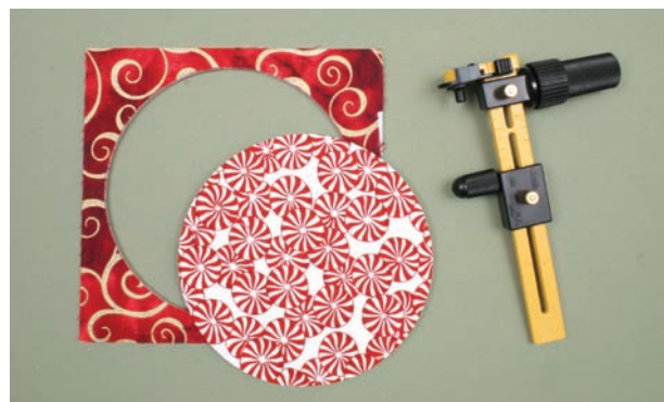
A circle cutter makes the job faster and easier.