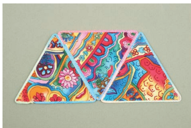
Sew the 3 triangles together.