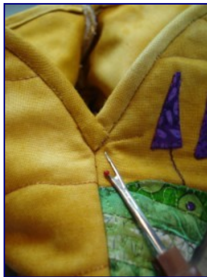
Click Images to Enlarge and Print