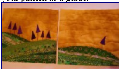
Click Image to Enlarge and Print