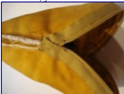
Click Image to Enlarge and Print

Pin and sew remaining side of zipper to other side of bag. Stitch edges of zipper (the tape edges) to lining being careful not to stitch through to the front. Do this for both sides. This will keep the zipper neat and clean looking on the inside of the bag. (insert image 549)