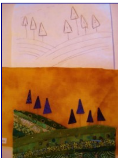
Click Image to Enlarge and Print